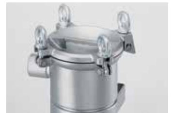
Ergonomic, integral cover handle is easy to open and close