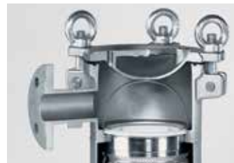
Compression bag hold down creates 360 degree sealing between filter bag and bag filter housing