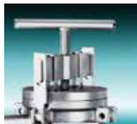
SIDELINE with T-bolt closure (TSBF)

Viton® is a registered trademark of E. I. du Pont de Nemours and company.